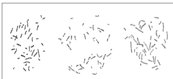
Fig. 3. Spread of chromosomes in metaphases to a degree allowing each of them to be evaluated (Olympus BX 61,

The average number of metaphases obtained after the preparation of 32 smears (N=32) from all 32 cell cultu-