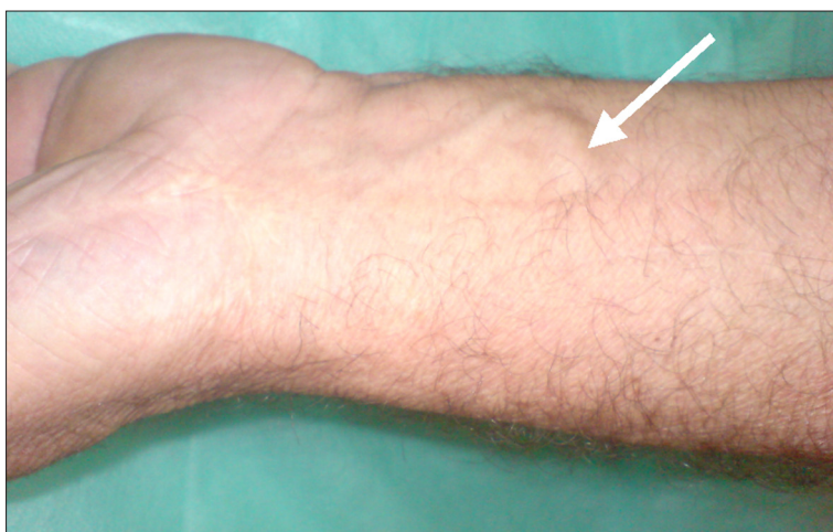
Fig. 1. The superficial variant route of the ulnar artery (arrow)

It was decided that hemodialysis would be the appropriate method of renal replacement therapy for this patient and vascular access creation was planned. During examination